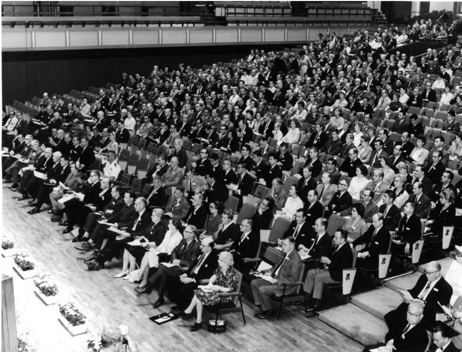
Audience at Opening Ceremony Third International Congress, Copenhagen 1965

The Third International Congress was held in the Falkoner Centret in Copenhagen, Denmark, 22nd-27th August 1965 under the High Patronage of His Majesty the King of Denmark. It was attended by eight hundred and fifty-four active partici-