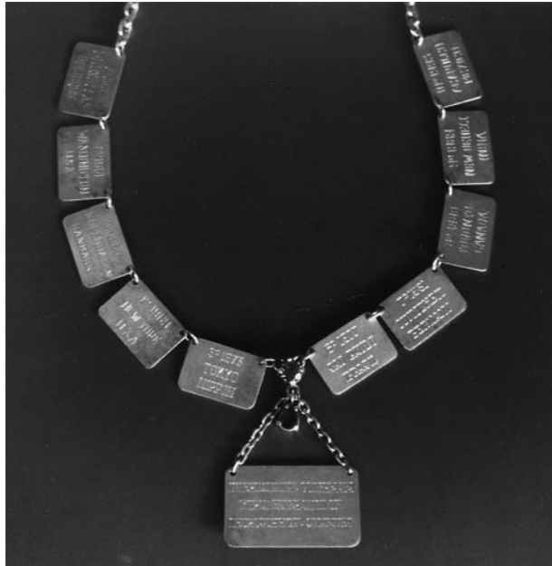
The first Chain of Office to be worn by the President

The plans for the next congress in 1961 gave rise to much, varied discussion. There was a general consensus that the combined neuroscience congress, as held in Brussels, was too large to permit a small, developing specialty to organize the relevant aspects effectively. Accordingly, an independent congress was favoured. The European delegates, in particular, although aware of the difficulties involved in holding an overseas congress, were keen to meet in North America the next time. They finally resolved to hold the 1961 congress on the east coast of the United States of