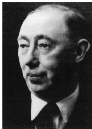
Sir Geoffrey Jefferson † President WFNS 1955-1957 Honorary President

The registration fee for the participants amounted to US $ 15 for active members, US $ 10 for associate members and US $ 5 for accompanying persons. The fee included a programme book, the book of abstracts and the proceedings, and also entitled the registrants to attend the social events arranged by the Congress, except for the official Banquet and Ball, for which an additional charge of US $ 9 was made.