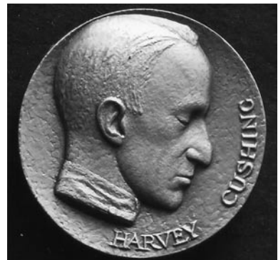
Medal presented to all participants as a souvenir of the Second International Congress