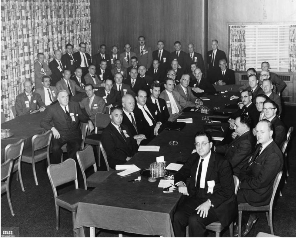
WFNS Executive Committee 1961